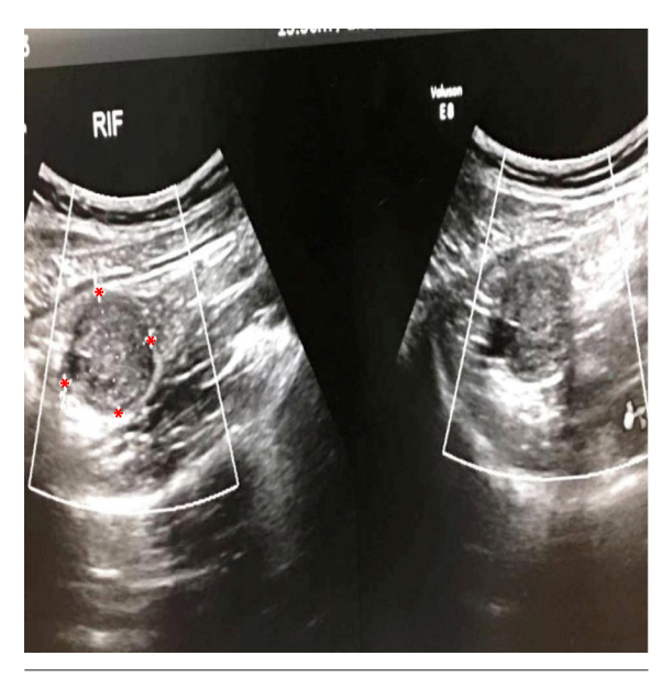
Figure 1: Mildly echogenic oval-shaped lesion measuring 31 × 26 mm (asterisks) noted in the right iliac fossa. The lesion also connected to a hypoechoic tubular structure (the appendix).

gastrointestinal stromal tumor (GIST) or a lowgrade fibrohistiocytic neoplasm. The presence of neutrophils within the muscularis propria of the appendiceal wall was evidence of acute appendicitis.